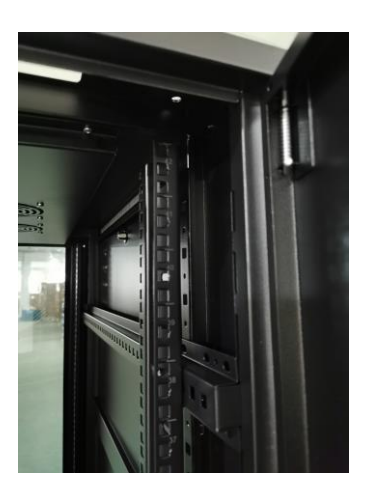
Marked 19" Rails + accessories