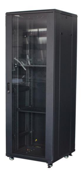
Front glass door with lock