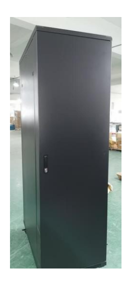
Back solid metal door