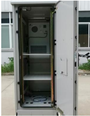
Front Door View