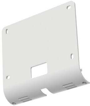
0° Mounting Bracket