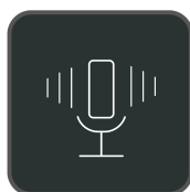
6 Mic for Superior Voice Pickup