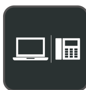
Multi-leading UC Platforms Compatibility