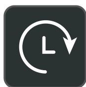
Ultra-long Battery Life