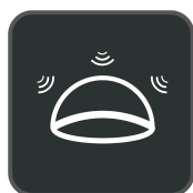
AI Noise Cancellation

The SP96 integrates 6 microphones and a 65mm speaker, utilizing advanced microphone technology and AI noise reduction to accurately pick up sound from any angle during calls, filtering out ambient noise and transmitting clear human voices. Combined with virtual bass technology, it enriches playback sound quality, delivering a premium audio experience. With an integrated liquid crystal display, it showcases a high-end appearance while intuitively displaying device status. Flexible cascade operation enables multiple devices to connect wirelessly, ensuring everyone in the meeting room can hear clearly. Its long battery life ensures prolonged participation and usage, and its multi-platform compatibility allows seamless use in work environments, providing users with a clear, immersive audio experience.