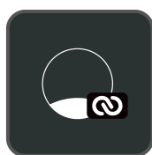
Flexible Daisy Chain